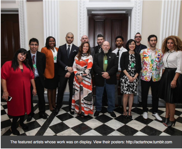
The featured artists whose work was on display. View their posters: http://actartnow.tumblr.com